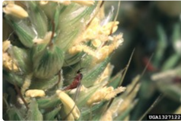
Photo 1. Adult sorghum midge, Stenodiplosis sorghicola .