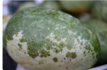
Photo 2. Papaya ringspot virus-W on watermelon (Fiji), showing characteristic ring patterns.