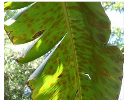
Photo 2. Tropical speckle, Ramichloridium species. The symptoms are best seen on the underside of the leaf as tan, circular blotches.