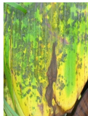
Photo 4. Leaf speckle, Mycosphaerella musae , on an older leaf.