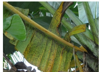
Photo 3. Leaf speckle, Mycosphaerella musae .