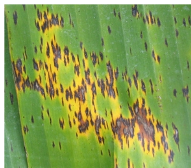
Photo 2. The brown or black streaks of Uredo musae , are often surrounded by yellow margins. The streaks feel rough to the touch.