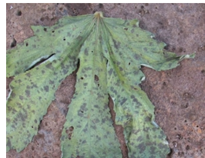
Photo 3. Upper surface of okra leaf showing dark patches of Pseudocercospora abelmoschi .