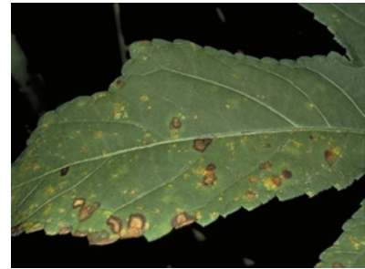
Photo 1. Spots, round to irregular with wide dark margins, on the upper surface of bele caused by leaf mould, Pseudocercospora abelmoschi .

If blemish-free leaves are required, use copper fungicides or mancozeb.