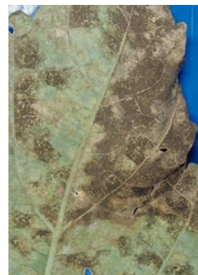
Photo 4. Leaf mould, Pseudocercospora abelmoschi . Patches joining together and forming spores on the underside of an okra leaf.