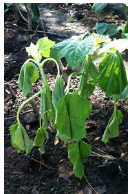
Photo 1. Bele wilt, caused by the water mould, Phytophthora nicotianae , attacking the roots.

Look for plants that wilt during the warmest parts of the day although the soil is still moist. At an early stage of the disease, look at the root system of wilting plants to see if the fine feeder roots are dead, and if there is any damage to the stem at soil level.