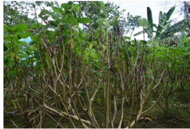
Photo 5. Several plants have lost their leaves and are dying due to root and basal stem rot caused by Phytophthora nicotianae .

Chemical control is not a method that can be used against this soil borne pathogen.