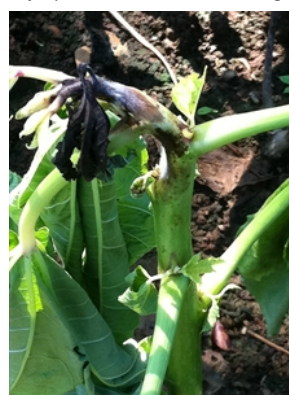
Photo 2. Bele wilt, Phytophthora nicotianae , showing the death of the young shoot at the top of the plant.