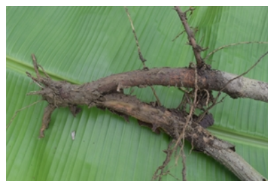
Photo 4. Root rot caused by Phytophthora nicotianae . Note the lack of roots, and that the lower stem has lost its bark, exposing the wood.