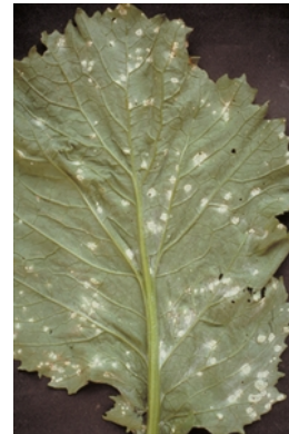
Photo 3. Pustules of white blister rust, Albugo candida , on the underside of a Chinese cabbage leaf. The pustules have burst and are releasing the powdery spores. On the upper surface the spots are yellow-green.