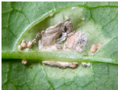
Photo 7. Close-up (Photo 6), white blister rust, Albugo species, on Ipomoea aquatica (Tonga), showing merging blisters containing the sporangia.