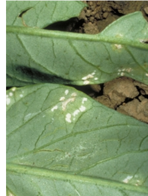
Photo 1. White rust (or white blister rust), Albugo ipomoeae-aquatica , on the underside of kangkong, Ipomoea aquatica .

Look for the white blisters on the underside of the older leaves, leaf stalks, stems and flowers. The blisters are round to oval and smooth at first, and then when they burst they release masses of white powdery spores.