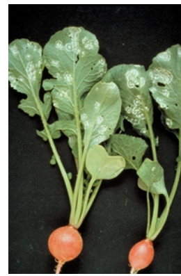
Photo 4. Pustules of white blister rust, Albugo candida , on the underside of radish leaves. The pustules are round at first, smooth, white and shiny. Later, they are powdery after they have burst to release the spores. Severe infection causes leaves to become distorted and to die early.

When using a pesticide, always wear protective clothing and follow the instructions on the product label, such as dosage, timing of application, and pre-harvest interval. Recommendations will vary with the crop and system of cultivation. Expert advice on the most appropriate pesticides to use should always be sought from local agricultural authorities.