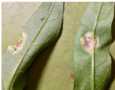
Photo 6. White blister rust, Albugo species, on Ipomoea aquatica (Tonga).