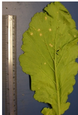
Photo 5. Pustules of white blister rust, Albugo candida , on leaves of Indian mustard.