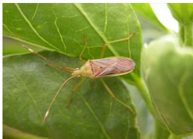
Photo 7. Amblypelta adult. (Note, this is unlikely to be the species on cassava and coconut. The species on coconut is Amblypelta cocophaga ; that on cassava has yet to be identified.)