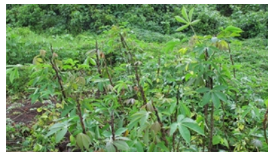
Photo 1. Shoot dieback on cassava caused by Amblypelta on cassava (Solomon Islands).

The species in Australia ( Amblypelta nitida and Amblypelta lutescens lutescens ) cause major problems on cashew, litchi and macadamia, feeding on those and many other tropical and subtropical crops, and causing premature fruit or nut fall and stunted plant growth.