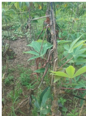
Photo 6. Severe cassava stem cankers (lower part) caused by Amblypelta with death of stem above (upper part).