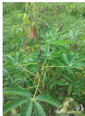
Photo 4. Shoot-tip dieback caused by Amblypelta on cassava (Malaita, Solomon Islands).