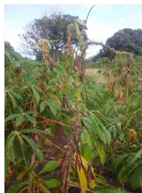
Photo 3. Shoot dieback caused by Amblypelta on cassava (southern highlands, Papua New Guinea).