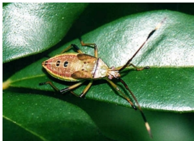
Photo 8. Amblypelta nymph. (Note, this is unlikely to be the species on cassava and coconut. The species on coconut is Amblypelta cocophaga ; that on cassava has yet to be identified.)