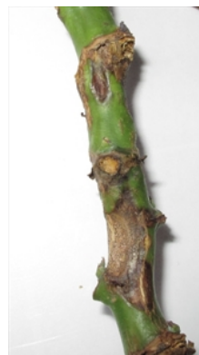
Photo 2. Close-up of the cankers on a cassava shoot after feeding by Amblypelta . Note the damaged areas have small black dots over them; these are the spore-containing sacs of a fungus that has invaded the areas damaged by Amblypelta .