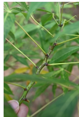
Photo 4. Dark streaks on a young green stem caused by Cassava brown streak virus .