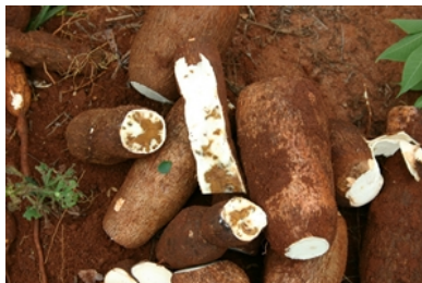
Photo 6. Brown dry rots in cassava roots infected with cassava brown streak disease.