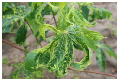
Photo 9. Cassava mosaic disease (CMD) symptoms in a field in Tanzania. Note leaf is severely deformed.