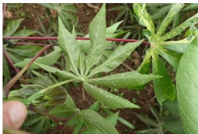
Photo 8. Whiteflies, presumably, Bemisia agentifolia , vector of the cassava brown streak viruses.