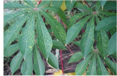
Photo 1. Symptoms of cassava brown streak disease mostly following the secondary veins, and the veins from them.

In Nigeria, IITA has established the Cassava Disease Surveillance Platform, where extension staff can upload images of plants suspected of CBSD (and other cassava diseases). There are immunological and molecular tests for the viruses.