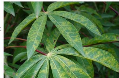
Photo 3. Patches developing from the secondary veins have joined with those from adjacent veins.