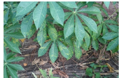
Photo 2. Cassava brown streak disease showing that the older leaves are those with symptoms.