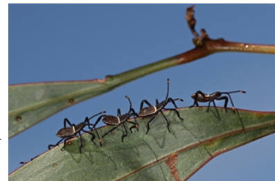
Photo 2. Nymphs of the crusader bug, Mictis profana on golden wattle.