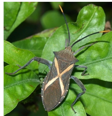
Photo 3. Adult crusader bug, Mictis profana .