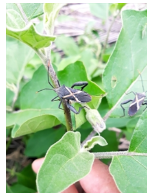
Photo 4. Adult crusader bug, Mictis profana , on eggplant.