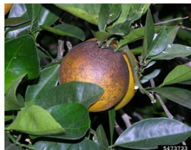
Photo 2. Citrus rust mite, Phyllocoptruta oleivora , damage on an orange.