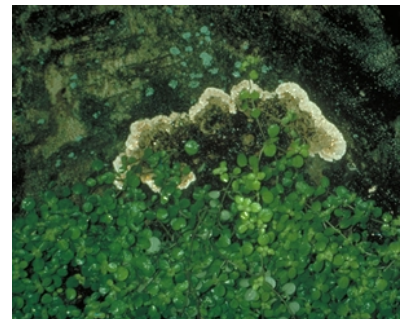
Photo 2. Sterile crust of Phellinus noxius on a breadfruit trunk.