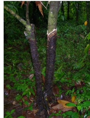
Photo 1. Sterile crust of Phellinus noxius on the outside of cocoa trunks. The brown crust has a distinct white margin.

Look for the sterile crust that grows up the trunk from the base of infected trees. Look for brackets of the fungus on old stumps of forest trees. In cocoa plantations, look for brackets on shade trees, for example, on Leucaena .