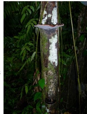
Photo 3. Bracket belonging to Phellinus noxius on a forest tree left for shade adjacent to the cocoa tree with a sterile 'stocking' (seen in Photo 1).