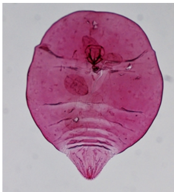
Photo 6. Slide-mounted body of the coconut (false) scale, Aspidoiotus rigidus .