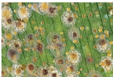
Photo 7. Adults and nymphs of the coconut scale, Aspidoiotus destructor . Note that the egg skins are around the margin in contrast to those of the coconut (false) scale, which are in a crescent on one side of the cover.