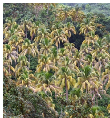
Photo 2. Yellowing of mature palms, due to infestation of coconut (false) scale, Aspidiotus rigidus .