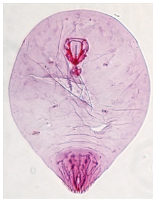
Photo 5. Slide-mounted body of the coconut scale, Aspidoiotus destructor .