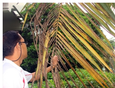
Photo 3. Yellowing and drying of leaflets of a coconut frond infested by the coconut (false) scale, Aspidiotus rigidus .