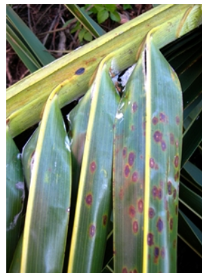
Photo 1. Oval spots with small grey centres and dark brown margins of Pseudoepicoccum cocos .

Fungicides are unlikely to have any impact on these diseases given the minor damage they cause, the difficulty in applying them, their cost and their use is not recommended.