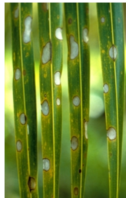
Photo 3. Spots of grey leaf spot, Pestalotiopsis palmarum .