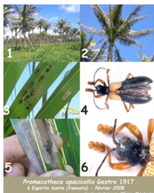
Photo 6. A poster showing symptoms caused by the coconut leafminer, Promecotheca species, and its biology.