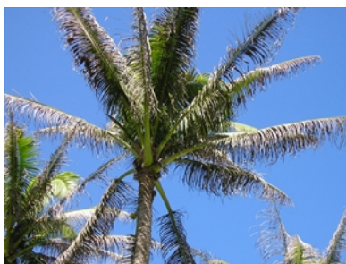
Photo 5. Single coconut palm to show the extensive leaf damage when attacked by the coconut leafminer, Promecotheca species.

When using a pesticide, always wear protective clothing and follow the instructions on the product label, such as dosage, timing of application, and pre-harvest interval. Recommendations will vary with the crop and system of cultivation. Expert advice on the most appropriate pesticides to use should always be sought from local agricultural authorities.