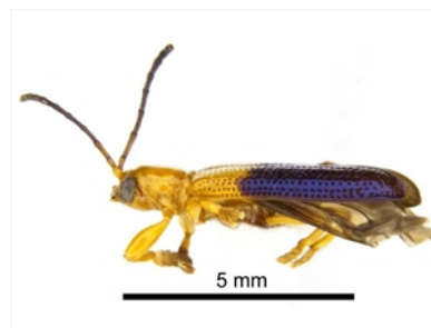
Photo 3. Adult Fiji coconut hispid, Promecotheca caerulipennis .