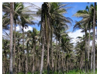
Photo 4. Extensive leaf decay in a plantation attacked by the coconut leafminer, Promecotheca species.