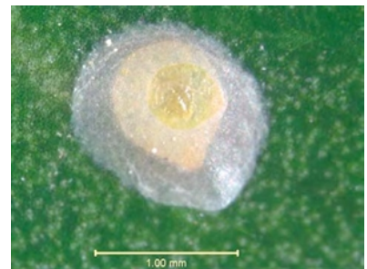
Photo 2. Female coconut scale, Aspidiotus destructor . Note that the body of the insect can be seen beneath the scale, hence the alternative name of 'transparent scale'.