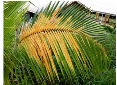
Photo 1. Coconut from showing damage due to coconut scale, Aspidiotus destructor .

Look for almost circular, whitish, waxy scales, so thin that the yellowish body of the insect can be seen beneath. Look for coconut leaflets that are covered with a yellow crust of scales when there are heavy infestations.