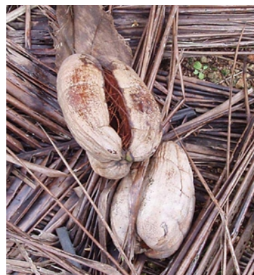
Photo 3 'Dry' nuts like those said to be produced on palms infested with Axiagastus campbelli . (This image was taken in Guam and sent to PestNet - www.pestnet.org - for identification.)