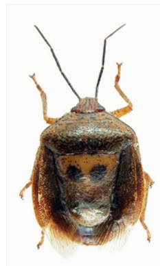
Photo 1. Axiagastus rosmarus . This is given as an example of a stink bug similar to Axiagastus campbelli .

The use of insecticides is not recommended. The bug is usually under control naturally, and outbreaks only occur occasionally. Insecticides would only increase the time before the balance between the pest and its predators and parasitoids was re-established. Additionally, there is the difficulty of spraying mature palms, making the application of insecticides difficult as well as uneconomic.