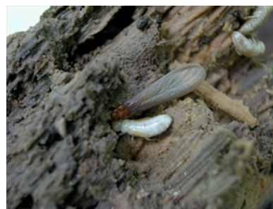
Photo 1. Winged adult and worker termites, Neotermes rainbowi .

Look for the net-like grooves covered with a mix of wood and faecal matter within the bark of coconuts; these channels are characteristic for the species. Look for hollowed out stumps.