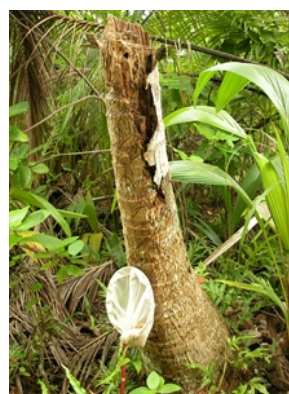
Photo 4. Attack by the coconut termite, Neotermes rainbowi , has produced the characteristic grooves in the trunk, destruction of internal tissues and death of the palm.