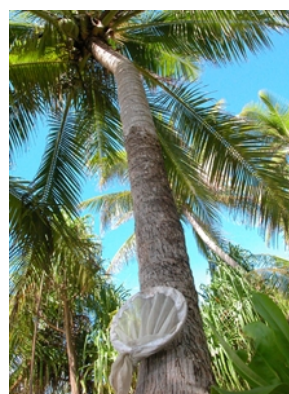
Photo 3. Characteristic grooves in the trunk of a coconut palm made by the coconut termite, Neotermes rainbowi .