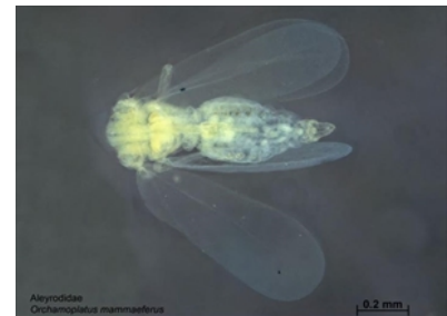
Photo 2. Adult croton whitefly, Orchamoplatus mammaeferus .