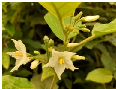
Photo 5. Flowers, devil's fig, Solanum torvum .

----- When using a pesticide, always wear protective clothing and follow the instructions on the product label, such as dosage, timing of application, and pre-harvest interval. Recommendations will vary with the crop and system of cultivation. Expert advice on the most appropriate herbicides to use should always be sought from local agricultural authorities.