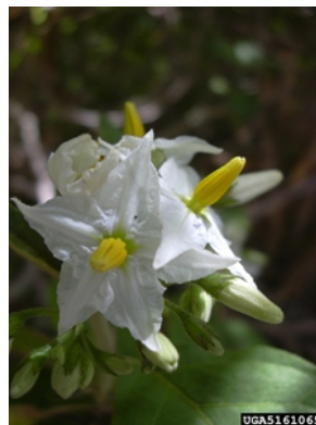
Photo 6. Flowers, devil's fig, Solanum torvum .