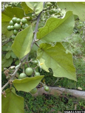
Photo 8. Fruits, devil's fig, Solanum torvum .