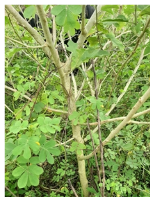
Photo 3. Stem and branches, devil's fig, Solanum torvum , showing the thorns.