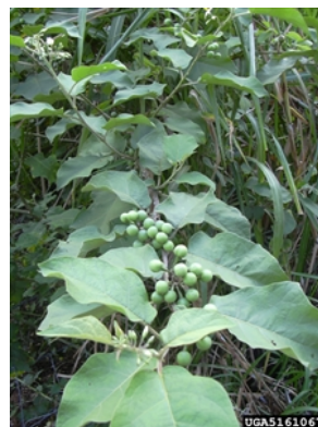
Photo 4. Thorns on the stems at the back of the photograph, devil's fig, Solanum torvum . Note, the shape of the leaves: near oval and with short leaf stalk. (Fruit also present.)