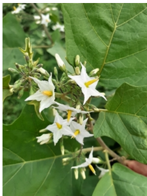
Photo 7. Flowers, devil's fig, Solanum torvum .