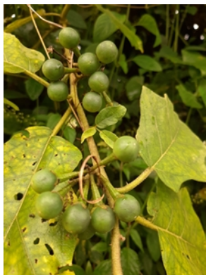
Photo 9. Close-up fruits, devil's fig, Solanum torvum .