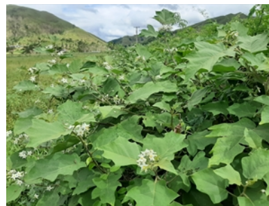
Photo 1. Thicket of devil's fig, Solanum torvum .

It is sometimes cultivated for its edible fruits, and is used in Thai, Loa, Indian and Jamaican cuisine, in soups, sauces, pastes and curries. Used as an ornamental and as a root stock to avoid wilt diseases. The weed has a large number of medicinal uses, both for external and internal conditions.