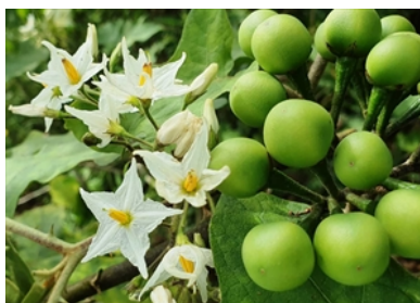
Photo 10. Flowers and fruits, devil's fig, Solanum torvum .