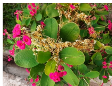
Photo 2. Masses of white flowers of dodder, Cuscuta campestris , growing on Euphorbia milii .