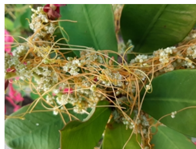
Photo 3. Close-up of flowers of dodder, Cuscuta campestris , on Euphorbia milii .