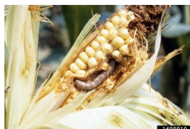
Photo 3. Mature larva of the fall armyworm, Spodoptera frugiperda , inside a maize cob. The whorl of leaves are usually the part most affected by the armyworm.