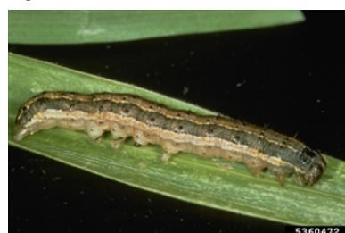
Photo 2. Mature larva of the fall armyworm, Spodoptera frugiperda .