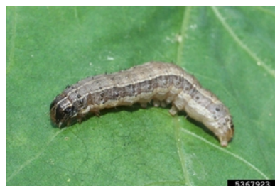
Photo 1. Mature larva of the fall armyworm, Spodoptera frugiperda . Note the inverted Y on the head, and the bristles from black spots. Another distinguishing characteristic is the four black dots (in a square) on the last abdominal segment.

In Africa (and elsewhere), pesticide-based control is often ineffective as the moth was introduced from the Americas with resistance to carbamate, organophosphorus, organochlorine, and pyrethroid insecticides. Ample cost-effective and practical options exist for non-chemical control of fall armyworm, including biological control and cultural means.