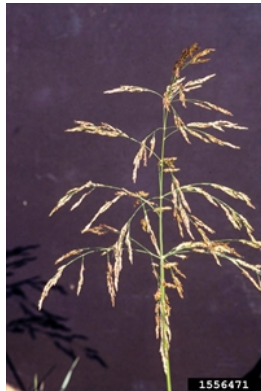
Photo 8. Close-up of flower head of Johnson grass, Sorghum halepense , showing the branching.