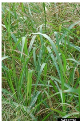
Photo 5. Johnson grass, Sorghum halepense , showing long leaves with white midrib.

When using a pesticide, always wear protective clothing and follow the instructions on the product label, such as dosage, timing of application, and pre-harvest interval. Recommendations will vary with the crop and system of cultivation. Expert advice on the most appropriate herbicides to use should always be sought from local agricultural authorities.