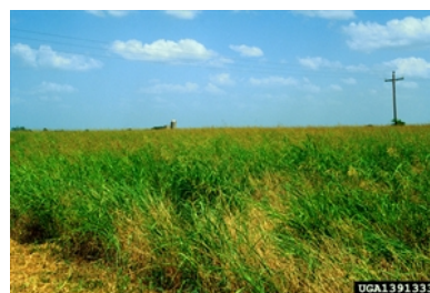
Photo 2. Dense stand of Johnson grass, Sorghum halepense .