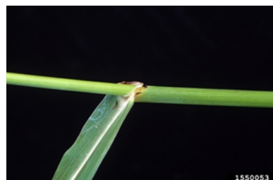
Photo 4. Close-up of junction between stem and leaf of Johnson grass, Sorghum halepense , showing the ligule.