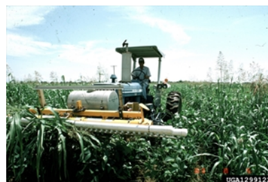
Photo 1. Infestation of Johnson grass, Sorghum halepense , in soybean.

Johnson grass is an important fodder grass in the sub-tropics; it has a similar protein content to alfalfa (lucerne) and a similar quality to that of other fodder grasses. It is used to control soil erosion because of its extension root system.