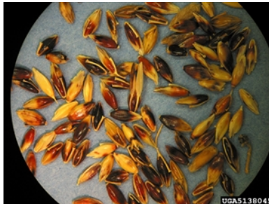
Photo 9. Seeds, Johnson grass, Sorghum halepense .