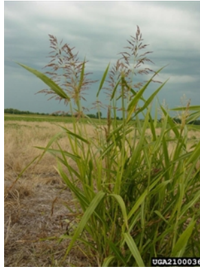
Photo 7. Flower of Johnson grass, Sorghum halepense .