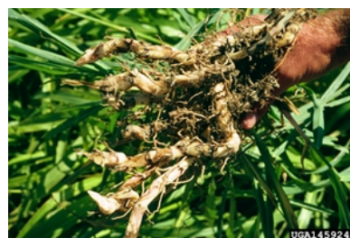
Photo 3. Roots and rhizomes, Johnson grass, Sorghum halepense .