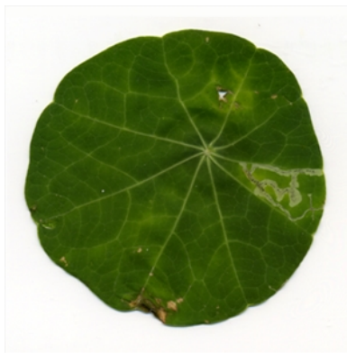
Photo 6. Cabbage leafminer, Liriomyza brassicae , mines on Nasturtium .