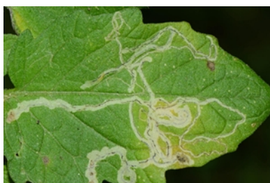
Photo 5. Characteristic patterns of damage on tomato made by the larvae or maggots of a Liriomyza leafminer feeding just under the surface layer of the leaves.

When using a pesticide (even a biopesticide), always wear protective clothing and follow the instructions on the product label, such as dosage, timing of application, and pre-harvest interval. Recommendations will vary with the crop and system of cultivation. Expert advice on the most appropriate pesticide to use should always be sought from local agricultural authorities.