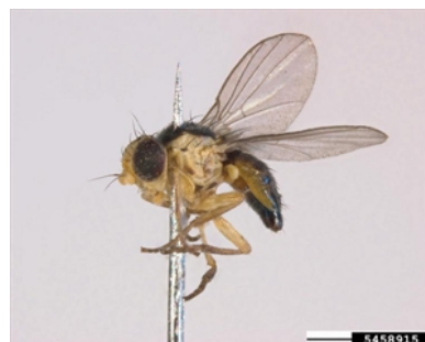
Photo 1. Adult vegetable leafminer, Liriomyza sativae (side view). The adults feed on sap from leaves and nectar.

Eggs are laid just beneath the leaf surface, beginning a day or so after the adults emerge, and continuing for several weeks. The eggs hatch after a few days and the larvae or maggots mine the leaves (Photos 5-7). The maggots are colourless at first, becoming green and then yellow as they mature; they are up to 3 mm long. Frass (larval faeces) is seen as black lines at the side of the mines.