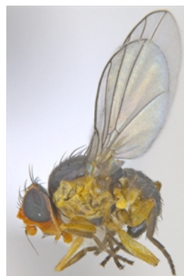
Photo 2. Adult chrysanthemum leafminer, Liriomyza trifolii (side view).