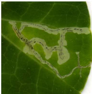
Photo 7. Close-up of Photo 3, showing the mines of cabbage leafminer, Liriomyza brassicae .