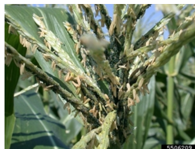
Photo 1. Colonies of the maize aphid, Rhopalosiphum maidis , on the tassels of maize.

Look for colonies in the whorls of leaves at the top of the maize. Look for ants that are attracted to the aphids' honeydew. Look for honeydew on leaves, tassels, and cobs.