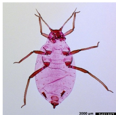
Photo 3. Adult maize aphid, Rhopalosiphum maidis ,