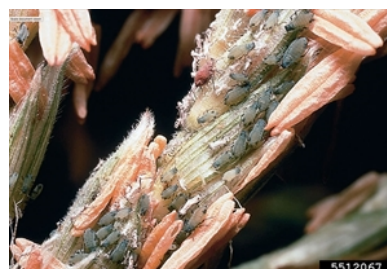
Photo 2. Maize aphids, Rhopalosiphum maidis ,