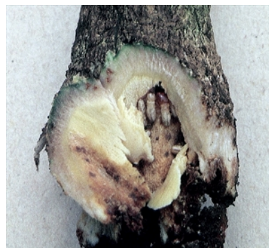
Photo 2. Collar region of the stem cut open to show the grubs inside of the ginger weevil, Elytroteinus subtruncatus .