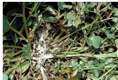
Photo 1. Cottony growth of Athelia rolfsii at the base of a peanut plant causing leaves to wilt.

Look for the thick white cottony growth at soil level and the presence of sclerotia. Look for plants that have wilted suddenly.