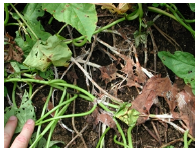
Photo 5. Cottony growth of Athelia rolfsii on mature vines of sweetpotato.

Many fungicides have been recommended for the control of Athelia rolfsii , but they are either not available and/or too expensive for use in Pacific island countries.