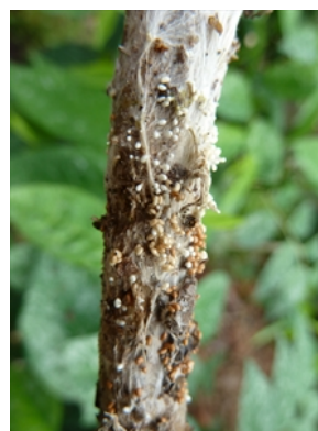
Photo 3. Cottony growth of Athelia rolfsii on a peanut stem, with many light brown mature sclerotia, and others developing.