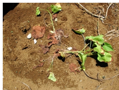
Photo 2. Wilt of sweetpotato cutting soon after planting caused by Athelia rolfsii .