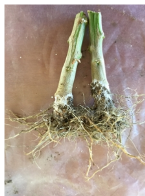
Photo 4. Roots and base of the stem of capsicum plants attacked and destroyed by southern blight, Athelia rolfsii .