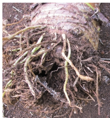
Photo 6. Roots of Alocasia attacked and killed by Athelia rolfsii causing the plant to fall over.