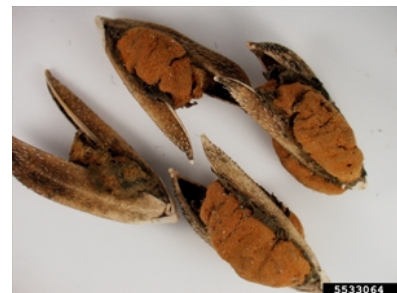
Photo 3. Grains of rice replaced by spore masses of Ustilaginoidea virens .