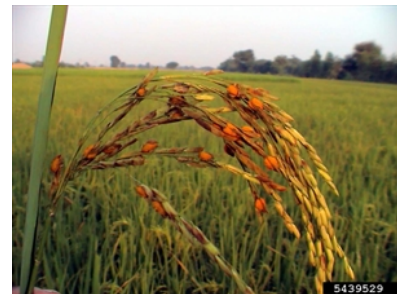
Photo 2. Spore balls of false smut, Ustilaginoidea virens , on rice.