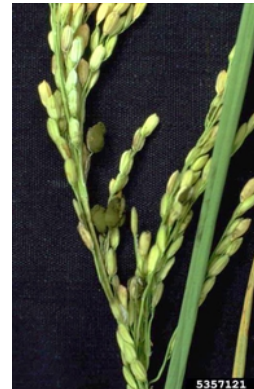
Photo 1. Spore balls of false smut, Ustilaginoidea virens , on rice.

Look for the orange to greenish-black balls of fungal growth on the panicles of rice plants. If unsure whether grain is contaminated, wash and collect any spores, and check identification under a microscope