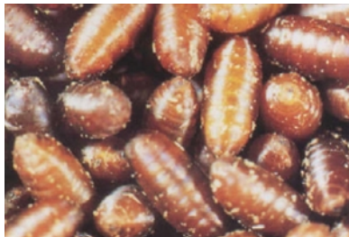
Photo 6. Fruit fly pupae.