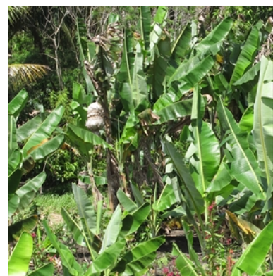
Photo 8. Banana leaves used to wrap a fruit bunch to prevent attack by fruit flies, other pests, and to promote uniform ripening, in Papua New Guinea.

AUTHOR Grahame Jackson Information (and photos) Fruit flies in Samoa (2002), SPC Pest Advisory Leaflet 32 ( https://lrd.spc.int/pest-advisory-leaflet?start=10 ); and from Fruit fly control methods for Pacific island countries and territories (2001), SPC Pest Advisory Leaflet 40. ( https://lrd.spc.int/pubs/cat_view/469-pest-advisory-leaflets ).