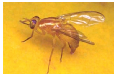
Photo 3. Pacific fruit fly, Bactrocera xanthodes , laying eggs.