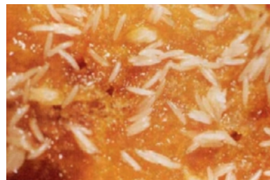
Photo 4. Fruit fly eggs.