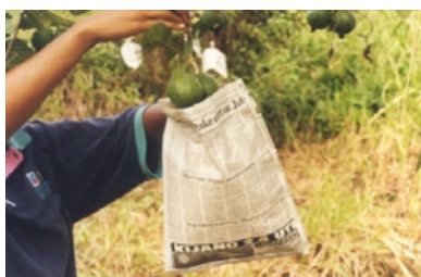
Photo 7. Newspaper with edges folded and stapled to form a bag in which to insert fruit to protect it from fruit flies.