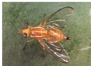
Photo 2. Pacific fruit fly, Bactrocera xanthodes .