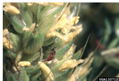
Photo 1. Adult sorghum midge, Stenodiplosis sorghicola .

A second method is to use a clear plastic bag placed over the blooming head, tap, remove the bag and count the number of midges. Repeat.