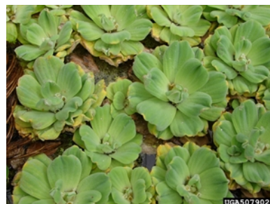
Photo 3. Close-up of leaves of water lettuce, Pistia stratiotes , showing the rosette formation and the characteristic pattern of the veins.