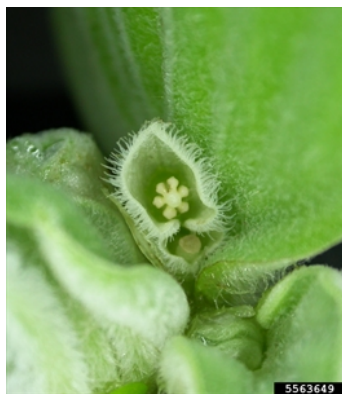
Photo 5. Close-up flower, water lettuce, Pistia stratiotes .

----- When using a pesticide, always wear protective clothing and follow the instructions on the product label, such as dosage, timing of application, and pre-harvest interval. Recommendations will vary with the crop and system of cultivation. Expert advice on the most appropriate herbicides to use should always be sought from local agricultural authorities.