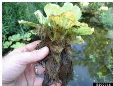
Photo 6. Single plant, water lettuce, Pistia stratiotes , showing the feathery roots.