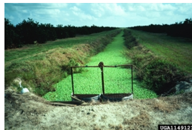
Photo 1. Irrigation canal choked with water lettuce, Pistia stratiotes .

The weed does have some useful characteristics, such as, medicinal properties and a fodder for cattle and pigs. However, these uses cannot compensate for its negative impacts as a weed.