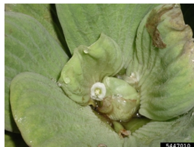
Photo 4. Flower, water lettuce, Pistia stratiotes .