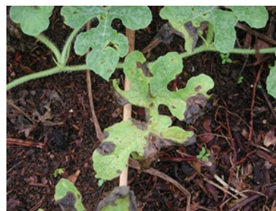
Photo 1. The large black spots are typical of gummy stem blight, Didymella bryoniae , on the leaves. Notice the concentration of the spots at the margins of the leaf where water stays for longer. Some of the spots have joined together.

Note, farmers sometimes mistake the disease for damage caused by caterpillars of a moth, Diaphania indica . These roll the leaves with silk threads and eat the parts between the veins (see Fact Sheet No. 33 ).