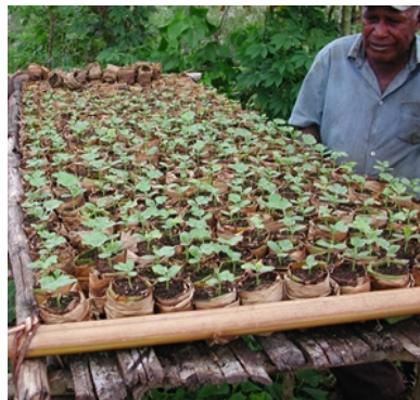
Photo 4. Checking in the nursery for infections of gummy stem blight, Didymella bryoniae , on seedlings of watermelon. This should be done at least twice a week. If infections are found, the plants should be removed and burnt. Notice that the nursery is high above ground.

When using a pesticide, always wear protective clothing and follow the instructions on the product label, such as dosage, timing of application, and pre-harvest interval. Recommendations will vary with the crop and system of cultivation. Expert advice on the most appropriate pesticide to use should always be sought from local agricultural authorities.