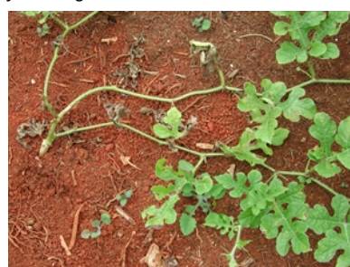
Photo 2. This is typical of the defoliation that occurs with gummy stem blight infection, making it a serious disease. Leaves go yellow, collapse and die when they have only a few spots. The older leaves die first.