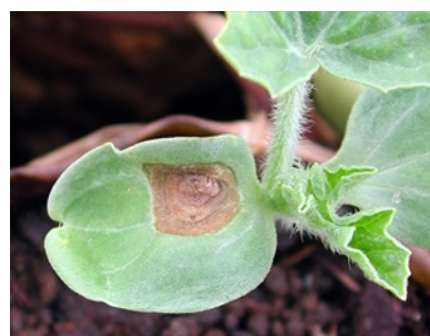
Photo 3. Gummy stem blight infection, Didymella bryoniae , on a seedling. It is just possible to see the black dots that contain the spores in the centre of the spot. Infection of seedlings in the nursery is a major threat to watermelon production as it means the fungus is taken to the field and early infection and spread is guaranteed.