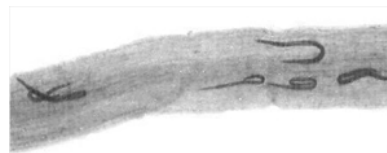
Photo 4. Pratylenchus coffeae inside a root.