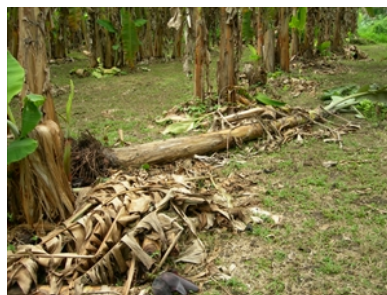
Photo 6. "Toppling" is a common symptom on banana when roots are attacked by Pratylenchus coffeae . Note this banana has fallen over before the fruits have matured; a sign of nematode attack. A similar symptom occurs when bananas are infected by the nematode Radopholus similis .