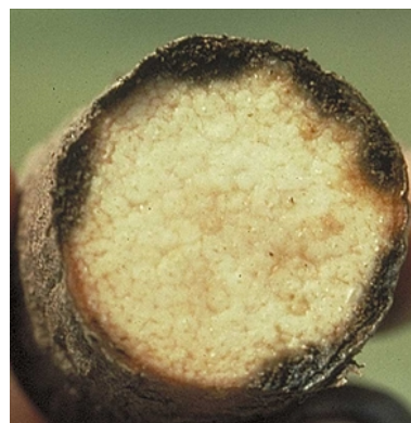
Photo 2. Pratylenchus coffeae in yam causes a shallow rot beneath the skin.