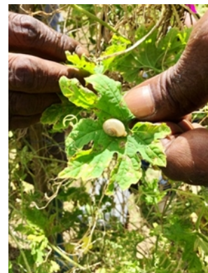
Photo 3. Asian tramp snail, Bradybaena similis , on bitter gourd.