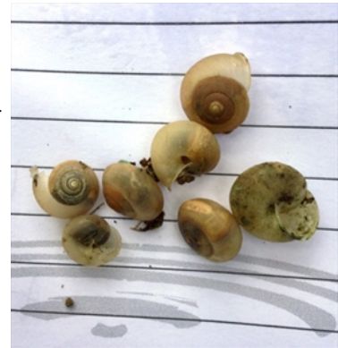
Photo 1. Collection of Asian tramp snails, Bradybaena similis , showing the variation of shell colour.

Bradybaena similis ; previously, Helix similis .