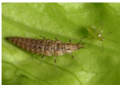
Photo 4. Larva of a brown lacewing, Micromus tasmaniae . Note, the pincer-like mouth parts.