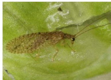
Photo 1. Adult brown lacewing, Micromus tasmaniae .

Brown lacewings belong to the family Hemerobiidae. Green lacewings belong to the family Chrysopidae (see Fact Sheet no. 270 ). There are many genera and species; this fact sheet uses Micromus tasmaniae as an example (Photo 1).