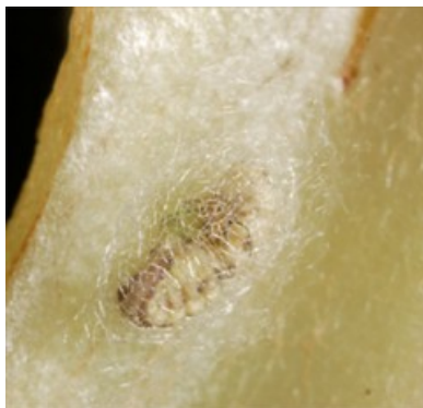
Photo 5. A pupa of a brown lacewing, Micromus tasmaniae .