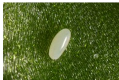
Photo 2. Translucent egg of brown lacewing, Micromus tasmaniae .