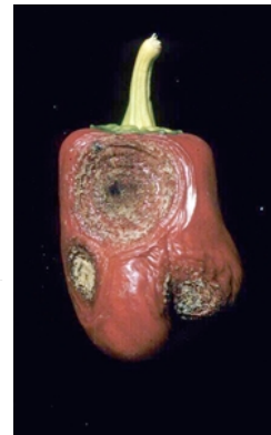
Photo 3. Large expanding spots on a mature capsicum fruit showing masses of spores that have discharged from the round spore-containing pycnidia.