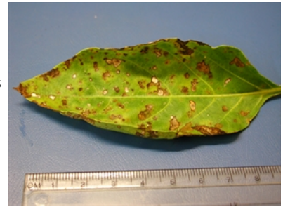
Photo 1. Small, irregular spots 1-2 mm, on a capsicum leaf, brown at first, later maturing to light grey with brown border.