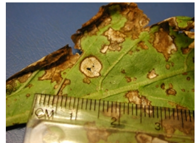
Photo 2. Close-up of a single spot showing the pycnidia (black dots) which contain large numbers of spores.