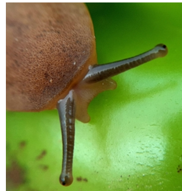
Photo 3. Antennae of the Caribbean leatherleaf slug, Sarasinula plebeia , with eyes at the ends.