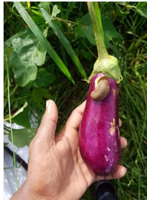
Photo 4. The Caribbean leatherleaf slug, Sarasinula plebeia , eating into an eggplant.