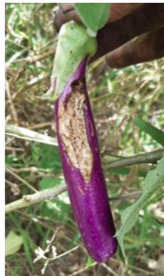
Photo 8. Damage to eggplant by the Caribbean leatherleaf slug, Sarasinula plebeia .

AUTHOR Grahame Jackson & Manu Mua Information from Sarasinula plebeia . Wikipedia. ( https://en.wikipedia.org/wiki/Sarasinula_plebeia ); and Veronicellidae: Sarasinula spp. Terrestrial Mollusc Tool. USDA, UF, Lucid. ( http://idtools.org/id/mollusc/factsheet.php?name=Veronicellidae%20Sarasinula%20spp. ); and from Brodie G, Barker GM (2012) Sarasinula plebeia (Fischer, 1868). Family Veronicellidae. USP Introduced Land Snails of the Fiji Islands. Fact Sheet Series, No. 4. ( https://www.researchgate.net/publication/265646912_Sarasinula_plebeia_Fischer_1868_Family_Veronicellidae ).