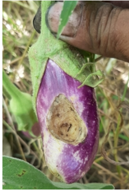
Photo 6. Damage to eggplant by the Caribbean leatherleaf slug, Sarasinula plebeia .