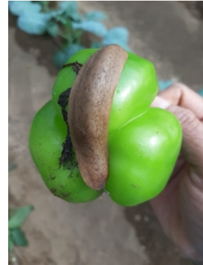
Photo 1. The Caribbean leatherleaf slug, Sarasinula plebeia , moving over a capsicum fruit.