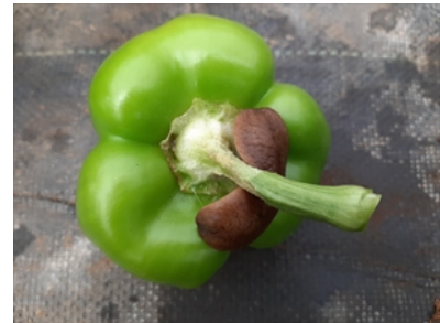
Photo 2. The Caribbean leatherleaf slug, Sarasinula plebeia , that has stopped moving and retracted into its mantle. Note the difference in size of the same slug when moving (Photo 1).