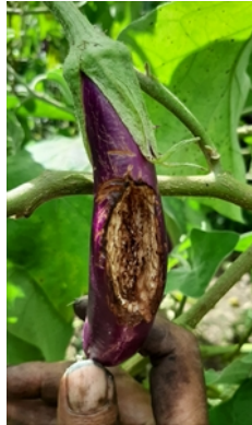
Photo 7. Damage to eggplant by the Caribbean leatherleaf slug, Sarasinula plebeia .