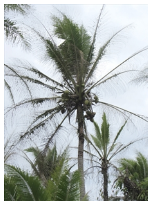
Photo 5. Close up coconut palm attacked by the stick insect, Graeffea crouanii . Note that the palm is recovering from the attack.