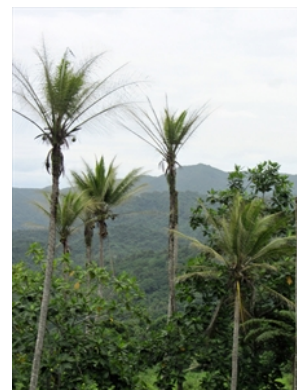
Photo 3. The stick insects, Graeffea crouanii , have stripped the coconut fronds leaving only the midribs.