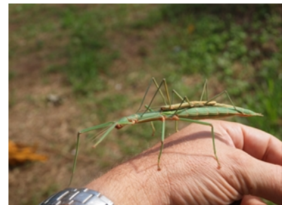
Photo 2. Male and female stick insect, Graeffea crouanii .