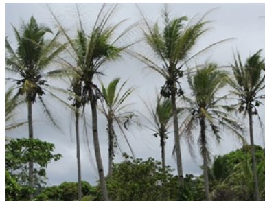
Photo 4. Group of coconuts attacked by the stick insect, Graeffea crouanii .