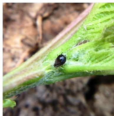
Photo 2. Adult cowpea aphid, Aphis craccivora .