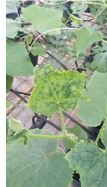
Photo 1. Mosaic on cucumber leaf caused by Cucumber green mottle mosaic virus .