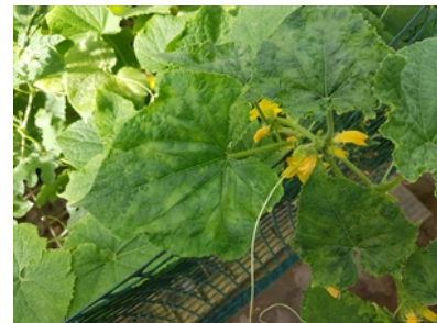
Photo 2. Several leaves on cucumber showing irregular mosaic patterns caused by Cucumber green mottle mosaic virus .