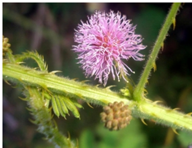
Photo 5. Flowerhead of giant sensitive plant, Mimosa diplotricha . Note, the fruits, left and beneath the stem, and the backward, curved thorns on the stem and leaf stalk.