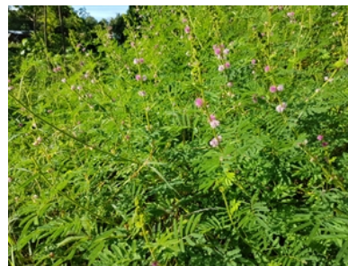
Photo 1. Thicket of giant sensitive plant, Mimosa diplotricha .

Mimosa diplotricha . It was known previously as Mimosa invisa . It is a member of the Fabaceae.