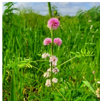
Photo 2. Individual plant, giant sensitive plant, Mimosa diplotricha , showing stem, leaves and flowers.