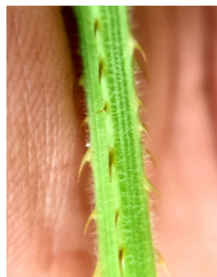
Photo 3. Backward-pointing thorns, giant sensitive plant, Mimosa diplotricha .