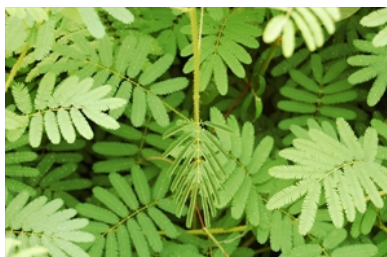
Photo 4. Leaves of giant sensitive plant, Mimosa diplotricha . Note, leaflets of the central leaf have collapsed.