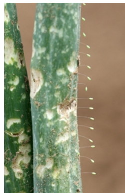
Photo 3. Group of lacewing eggs, Chrysoperla sp., fastened to a side of a branch.