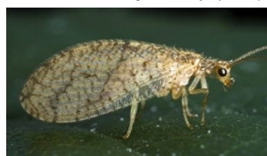
Photo 2. Brown lacewing adult, Micromus sp.