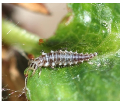
Photo 4. Larva of a green lacewing. Note