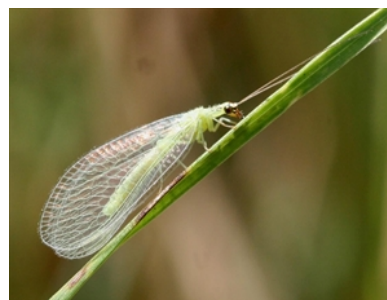
Photo 1. Green lacewing adult, Chrysoperla sp.

Green lacewings belong to the family Chrysopidae. Brown lacewings belong to the family Hemerobiidae. Two common genera of green lacewings are Chrysoperla and Chrysopa .