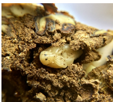
Photo 5. Close-up of Photo 3, showing pupa of the mango seed weevil, Sternochetus mangiferae , inside a mango seed.

AUTHOR Grahame Jackson & Mani Mua Information from 1 CABI Sternochetus mangiferae (mango seed weevil) (2017) Crop Protection Compendium. ( https://www.cabi.org/cpc/datasheet/16434 ); and Woodruff RE, et al. (2014) Featured Creatures: Mango seed weevil. UF/IFAS, University of Florida. ( http://entnemdept.ufl.edu/creatures/fruit/beetles/mango_seed_weevil.htm ); and from DAF (2017) Mango seed weevil. Queensland Government. ( https://www.daf.qld.gov.au/business-priorities/agriculture/plants/fruit-vegetable/insect-pests/mango-seed-weevil ); and Chin D et al. (2010) Field guide to pests, beneficials, diseases and disorders of mangoes. Northern Territory Government, Department of Resources, Australia. ( https://dpir.nt.gov.au/_data/assets/pdf_file/0006/227832/mango_field_guide.pdf ). Photo 2 Ken Walker (2005) Sternochetus mangiferae . PaDIL - ( http://www.padil.gov.au ).