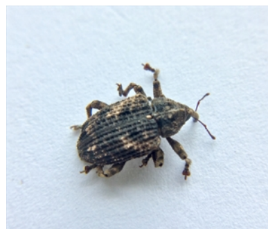
Photo 1. Adult mango weevil, Sternochetus mangiferae .

Sternochetus mangiferae ; previously, Cryptorhynchus mangiferae .