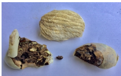
Photo 4. Pupa of the mango seed weevil, Sternochetus mangiferae , surrounded by frass.