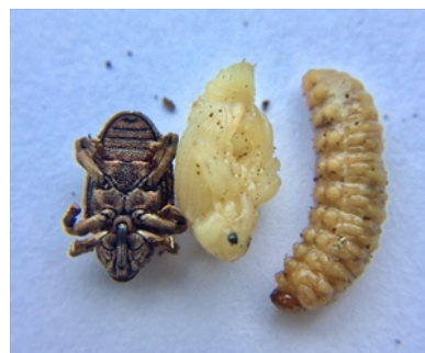
Photo 3. Larva, pupa and adult (ventral view) of the mango seed weevil, Sternochetus mangiferae .