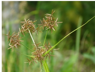
Photo 4. Flowerhead, nutgrass, Cyperus rotundus .

Cyperus rotundus . It is a member of the Cyperaceae.