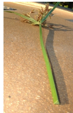
Photo 3. Triangular flower stem, nutgrass, Cyperus rotundus .