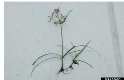
Photo 2. Single mature plant, nutgrass, Cyperus rotundus , to show underground stem or rhizome, with tubers.