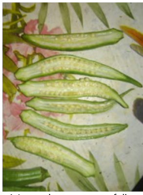
Photo 4. Internal appearance of distorted okra pods (see Photo 4).