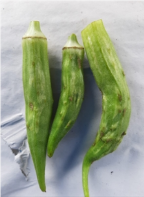
Photo 2. Numerous bumps and ridges on okra pods causing distortions (Fiji).