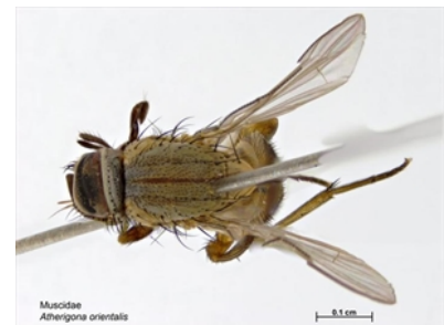
Photo 2. Adult pepper fruit fly, Atherigona orientalis (top view).