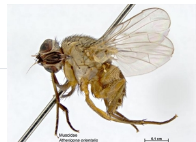
Photo 3. Adult pepper fruit fly, Atherigona orientalis (side view).