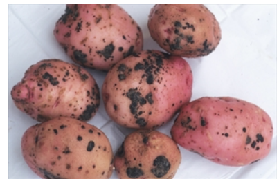
Photo 3. Black scurf, the name given to the appearance of potato tubers when sclerotia of Rhizoctonia solani form on the surface.