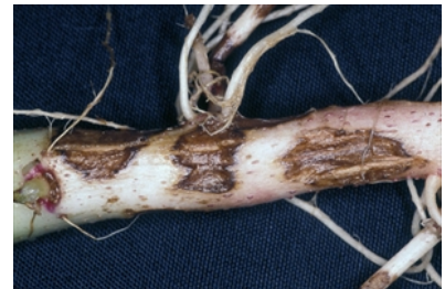
Photo 2. Close-up of underground stem of potato showing cankers caused by black scurf, Rhizoctonia solani .