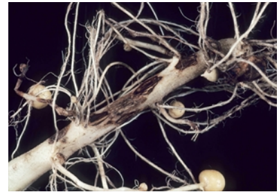
Photo 1. Underground stem of potato with cankers caused by black scurf, Rhizoctonia solani .

Rhizoctonia solani . It is also called Thanatephorus cucumeris , which is the sexual state; it may occur on the lower stems of potato. There are a number of strains, and the common one on potato is referred to as AG3.