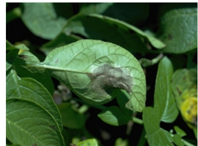
Photo 2. Underside of potato leaf with spot caused by late blight, Phytophthora infestans . Note spores form on the margin of the spot.