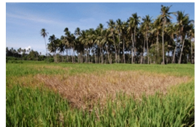
Photo 2. Hopperburn caused by the brown planthopper, Nilaparvata lugens . This occurs when large numbers of insects suck the sap from plants and cause them to wilt and die.