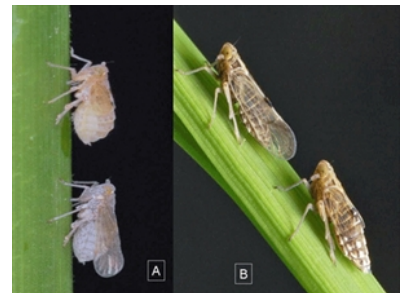
Photo 3. Close-up of nymphs (left) and adult (right) brown planthoppers, Nilaparvata lugens .