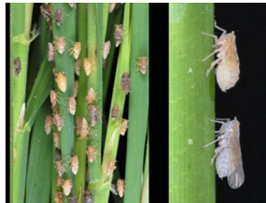
Photo 4. If insecticides are used, and there are no predators or parasites, populations of brown planthopper, Nilaparvata lugens , increase rapidly.