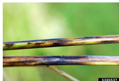
Photo 2. Rice stems with spots and large lesions of stem rot, Magnaporthe salvinii .