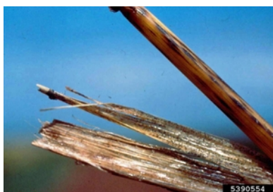
Photo 4. Sclerotia on leaf sheaths, and spots on a stem, caused by stem rot, Magnaporthe salvinii .