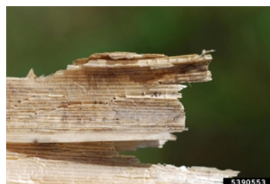
Photo 3. Sclerotia of stem rot, Magnaporthe salvinii , on the inside of a leaf sheath.